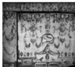
Spalliera a grottesche con animali e f...