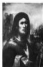
San Giovanni Battista, olio su tela, Gi...