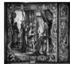
Cristo davanti ad Erode, arazzo, ...