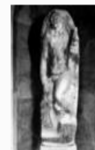
San Matteo, marmo, Michelangelo ...