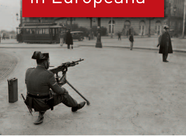
Armed Civil Guard in the street preventing a public transport strike (Plaça Espanya, Barcelona), 1933, by Brangulí. © ANC.

Multilingual functionalities for better search and retrieval in Europeana