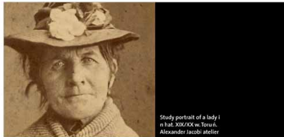
Study portrait of a lady in hat. XIX/XX w. Toruń. Alexander Jacobi atelier

DOWNLOAD THE 4 PAGES LEAFLET ( PDF , 3304 kb) AND THE BROCHURE ( PDF , 4527 kb)